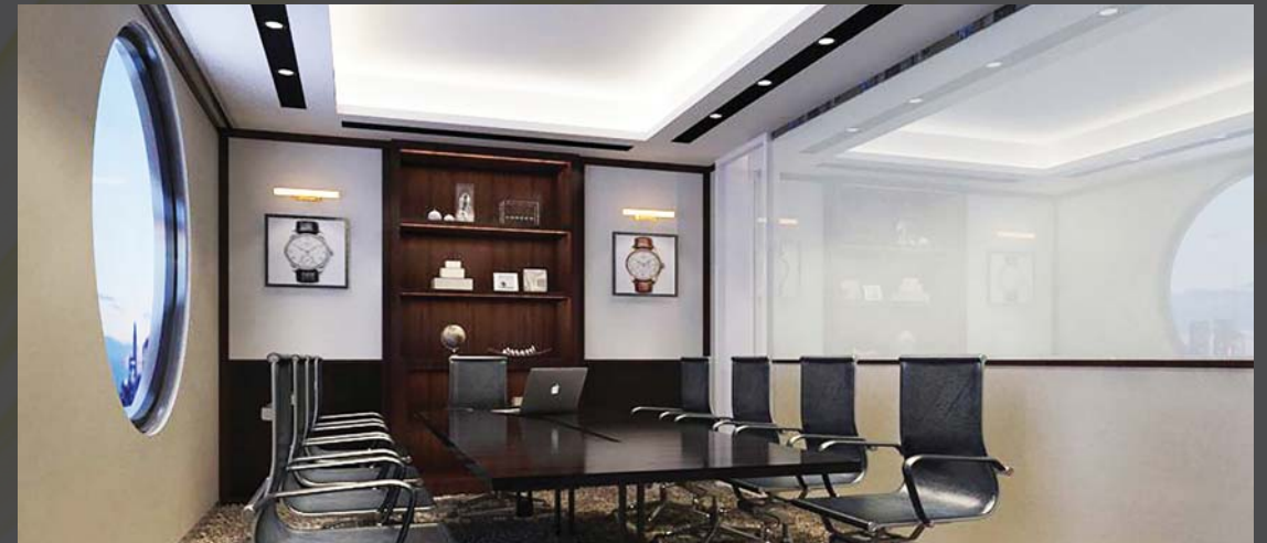
INTERIOR FITTING OUT WORK FOR IWC SCHAFFHAUSEN AND VACHERON CONSTANTIN OFFICE, CENTRAL, HK