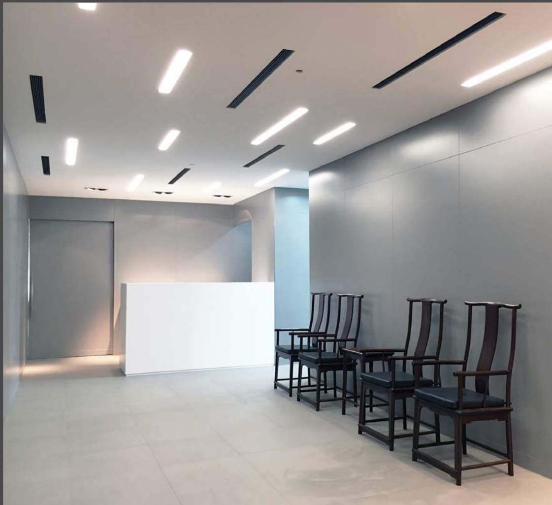
INTERIOR FITTING OUT WORK FOR ERMENEGILDO ZEGNA OFFICE, KOWLOON BAY, HK