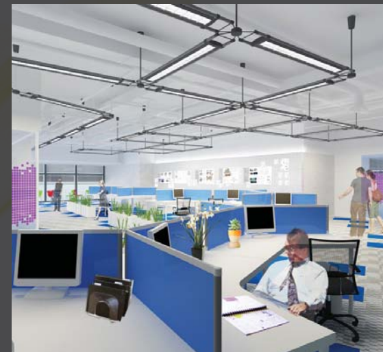
DESIGN PROPOSAL FOR DESIGN CONSULTANCY SERVICE FOR OFFICE, CYBERPORT, HK