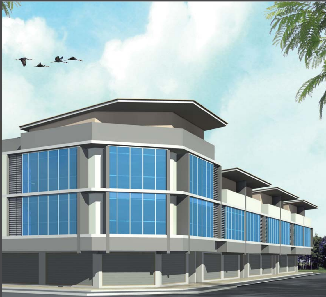
PROPOSED 24 UNITS SHOP OFFICE (COLLABORATION WITH PERUNDING KAH FIEN), DARUL RIDZUAN, PERAK, MALAYSIA