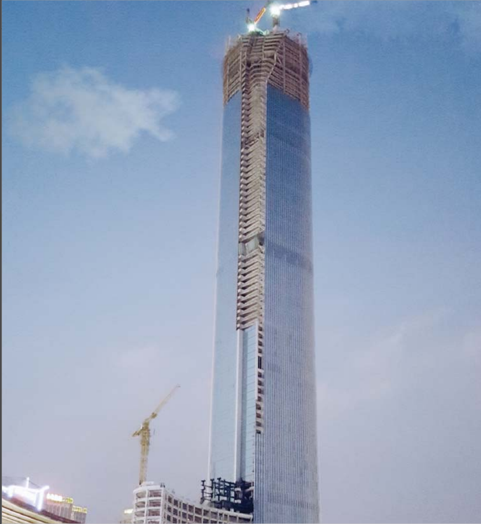
INTERIOR FITTING OUT WORK FOR OFFICE AT SUZHOU IFS, SUZHOU, PRC