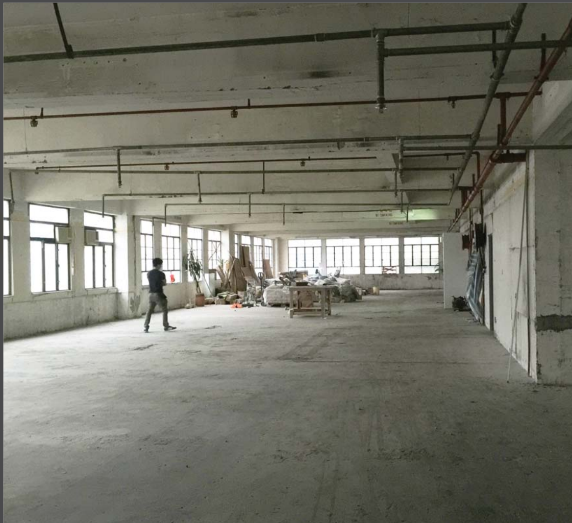
A&A WORK FOR 13/F & 14/F, WAH FUNG INDUSTRIAL CENTRE, KWAI FONG, HK (TO BE COMPLETED)