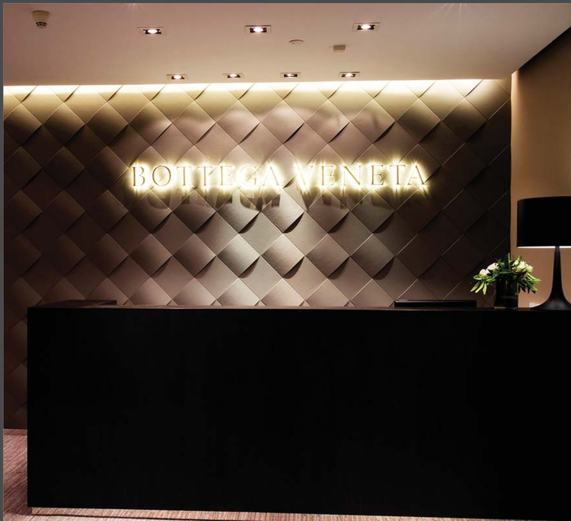
INTERIOR FITTING OUT WORK FOR BOTTEGA VENETA HEADQUARTER OFFICE, SHANGHAI, PRC