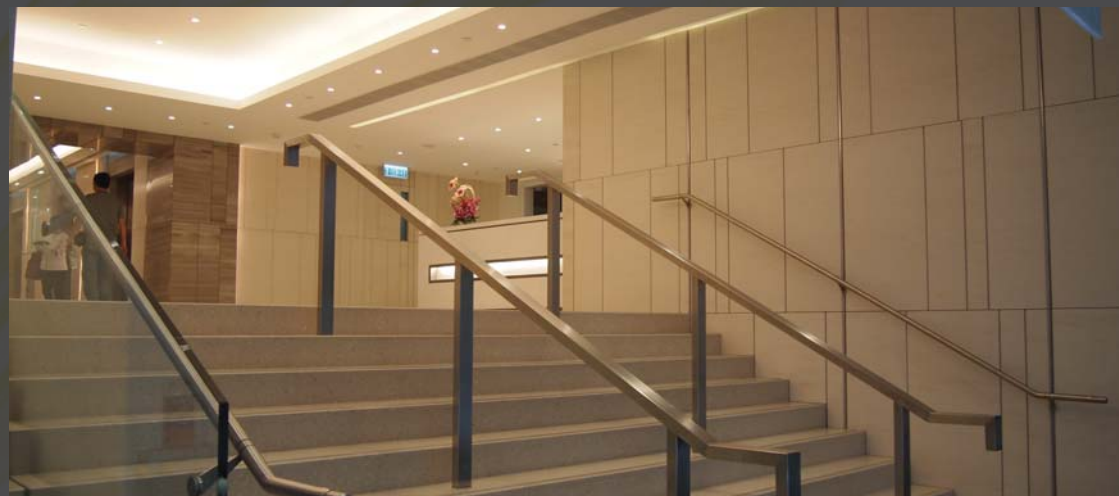
INTERIOR FITTING OUT WORK FOR G/F OFFICE LOBBY, WORLD COMMERCE CENTRE, TSIM SHA TSUI, HK