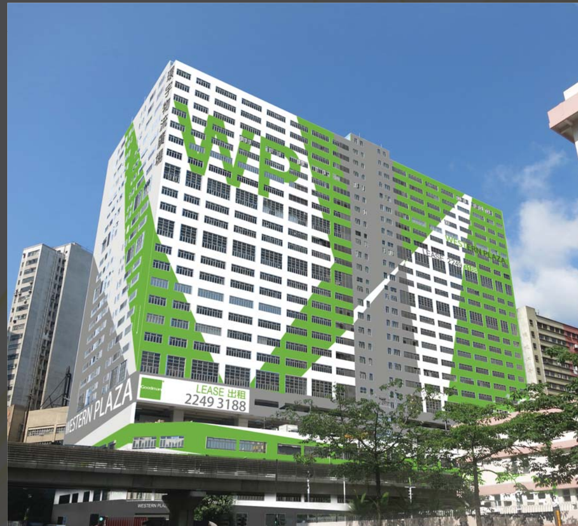
FAÇADE UPGRADING WORK FOR WESTERN PLAZA, TUEN WAN, HK