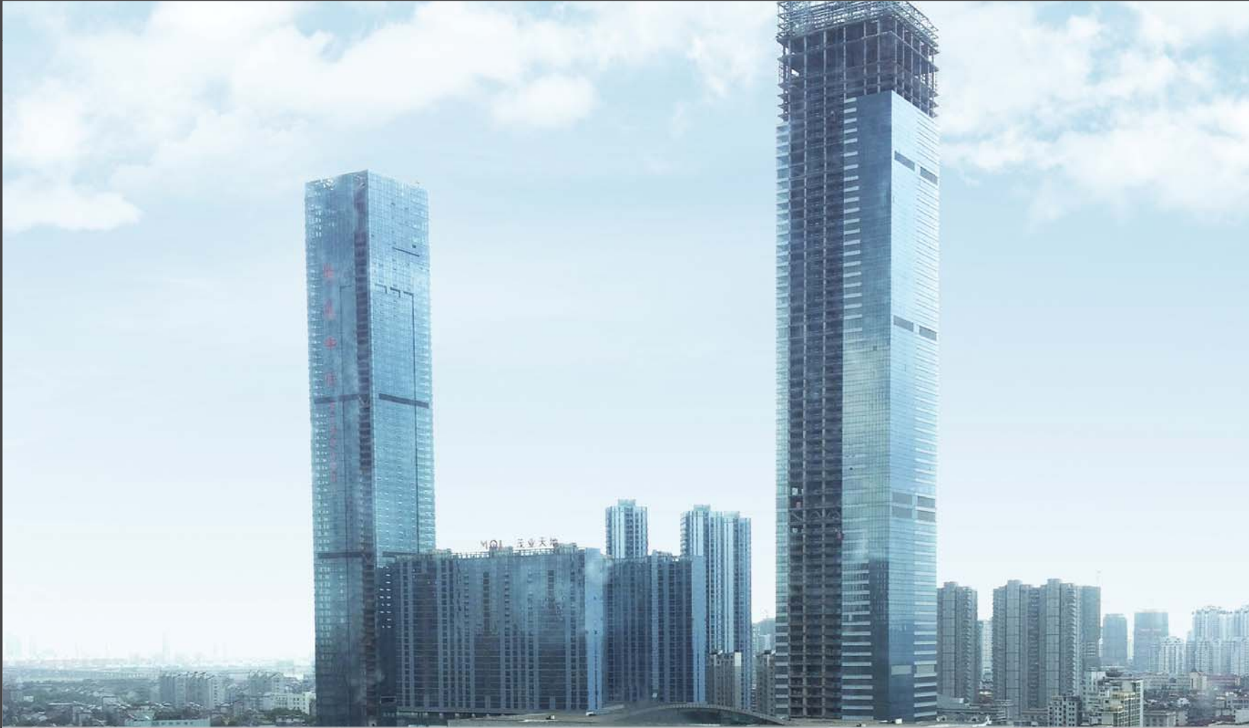
INTERIOR FITTING OUT WORK FOR OFFICE AT WUXI IFS, WUXI, PRC