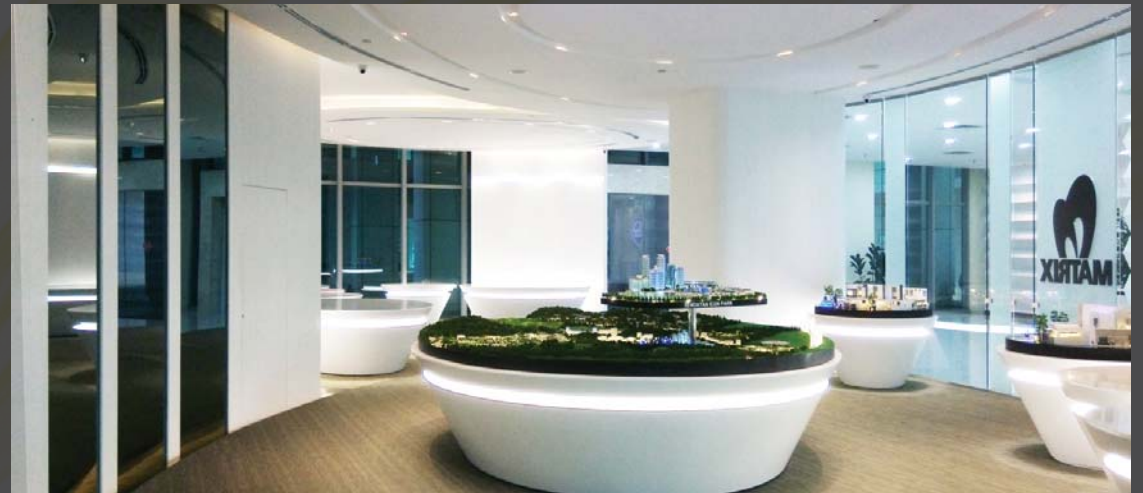
INTERIOR FITTING OUT WORK FOR MATRIX GALLERY, BRUNSFIELD TOWER 3, OASIS ARA DAMANSARA, MALAYSIA