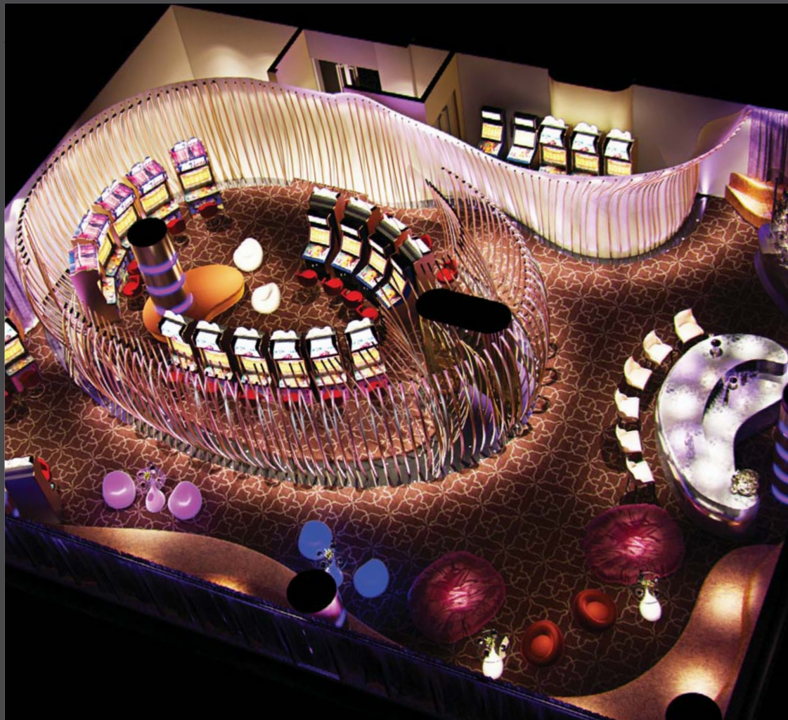
DESIGN PROPOSAL FOR OFFICE AND SHOWROOM, MACAU