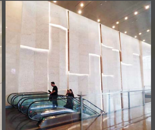
INTERIOR FITTING OUT WORK FOR CHENGDU IFS OFFICE TOWER T1 AND T2, CHENGDU, PRC