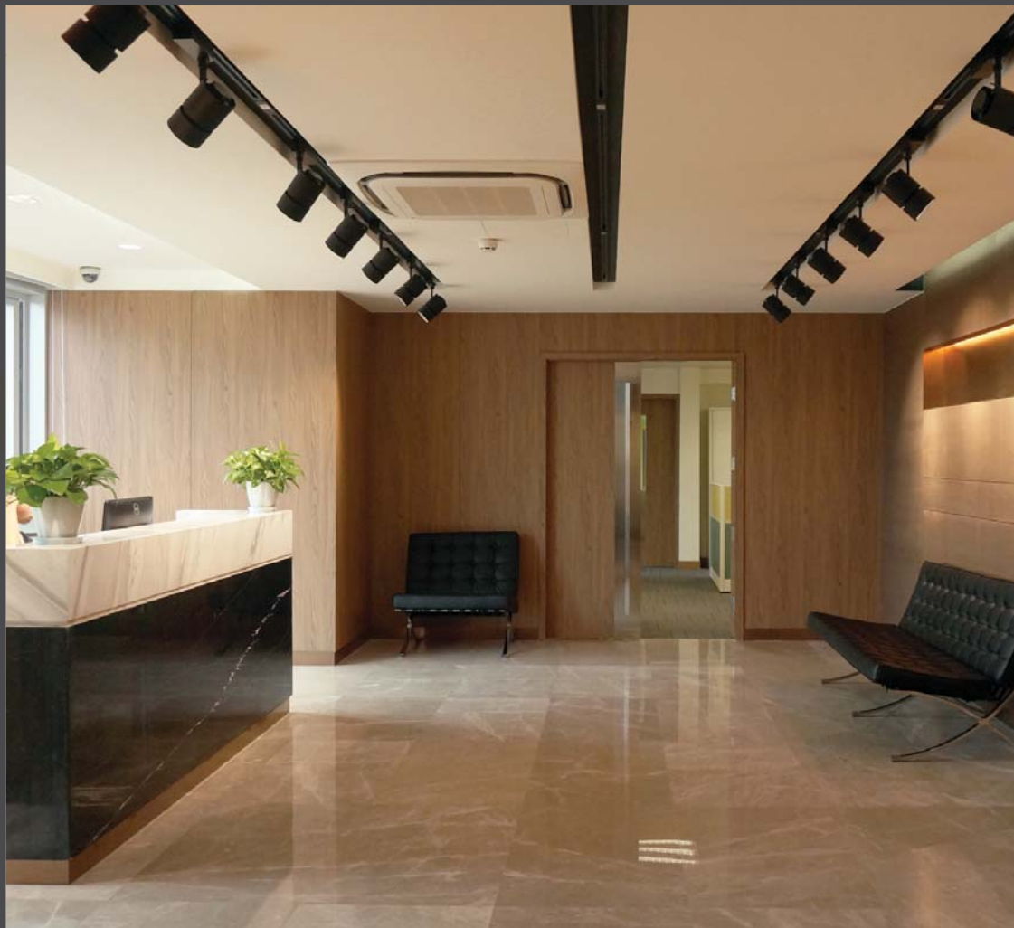
INTERIOR FITTING OUT WORK FOR SERVICED APARTMENT OFFICE, CHENGDU IFS OFFICE TOWER, CHENGDU, PRC